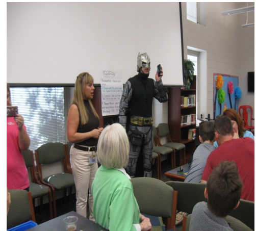
Having a lot of fun!