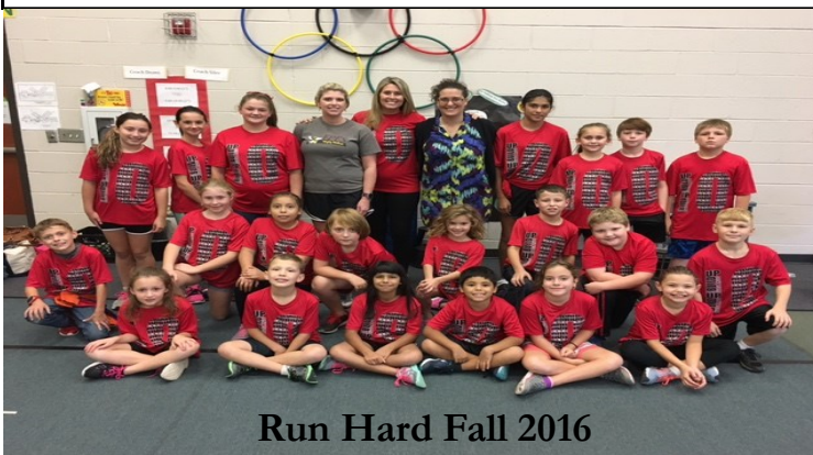
Run Hard Fall 2016